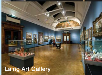
Laing Art Gallery